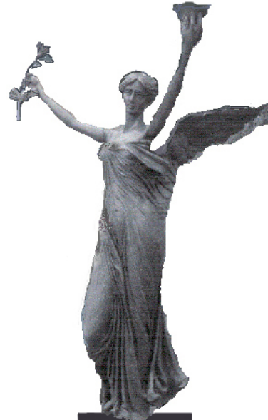
The Spirit of Life award statue in bronze